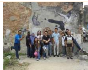
Avago Asia 26/9/2013