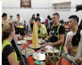
IPinGlobal SG 20/3/2016