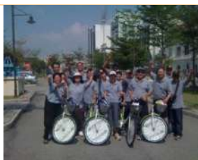
Eastin Hotel 29/10/2010