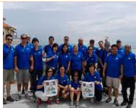
Pfizer Inter. 9/11/2016