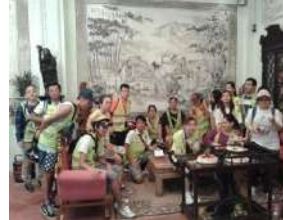
Panasonic Kulim 3/4/2013