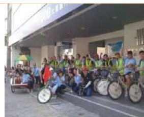
UOB PG HQ 12/5/2012