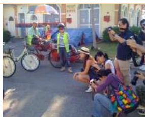
HK Media Group 5/1/2012