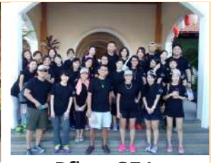
Pfizer SEA 12/5/2015