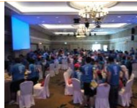
Khazanah Nasional 18/10/2016