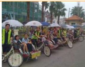
UOB Kelawei 30/6/2012