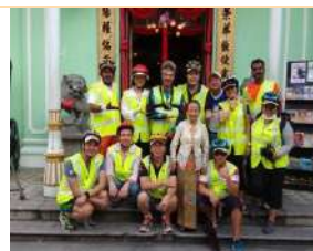
Bromma Ipoh 13/10/2014