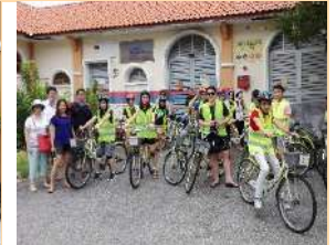
Crowe Howath SG 3/10/2016