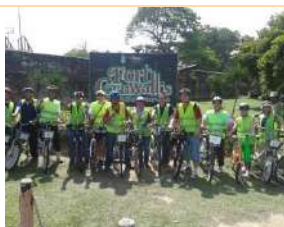
First Solar Kulim 13/12/2013