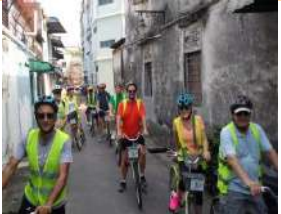
First Solar US 12/6/2015