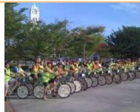
KPMG SG 30/9/2012