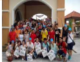
JTI SEA 24/10/2015