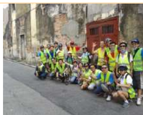
Intel PG 3/3/2014