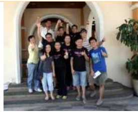
Samsung PG 14/12/2014