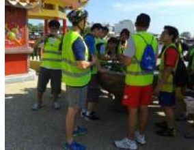
Intel PG 1/3/2013