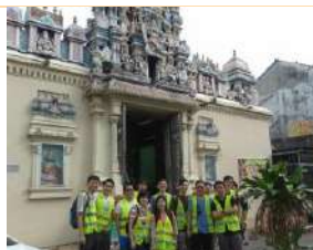
Altera PG 19/8/2013