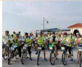
CWM Group 14/5/2016