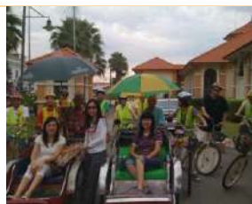
Jabil PG 19/4/2012