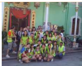
AMD PG 16/3/2012