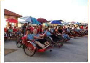
APPLE APAC 22/1/2016