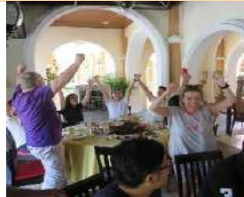
KFC ASIA 8/9/2016