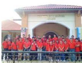
Coca-Cola Msia 17/10/2012