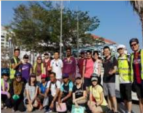
Intel PG 04/3/2016