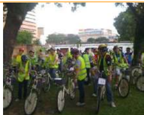
Great Eastern Insurance 8/9/2012