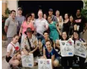
Flextronic Interna. 18/5/2016