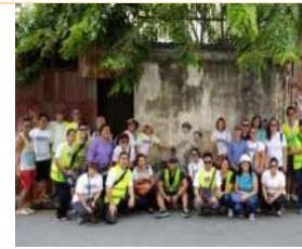
Hershey SEA 23/4/2015