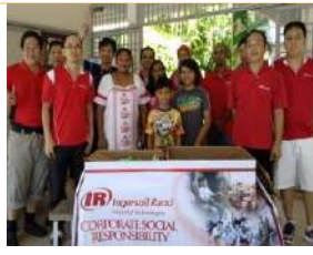
Ingersoll Rand 29/11/2014