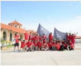
Four Points Hotel 1/11/2014