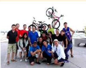
Elanco Int. 11/10/2016