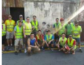
First Solar US 16/2/2013