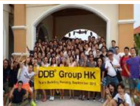
DDB Group HK 18/9/2015