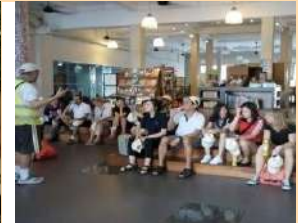
BOSCH APAC 8/6/2016