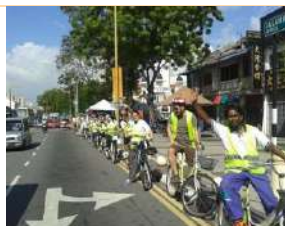
PTS Properties 29/6/2013