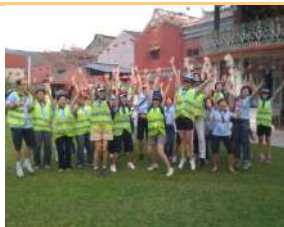
UOB BM 19/6/2012