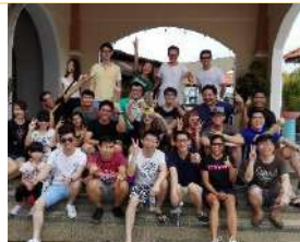
KPMG SG 5/11/2016