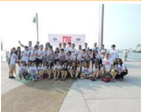
TTG ASIA 4/7/2016