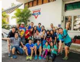
YMCA HK 7/1/2016