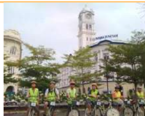
Fullerton SG 8/9/2012