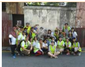
Continental Tire 23/2/2014