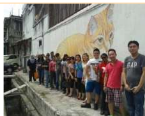
National Instru. 12/5/2014