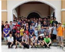
Motorola Solutions 21/9/2016