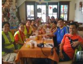
Monsanto SG 14/12/2012