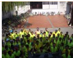
Motorola PG 31/10/2013