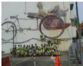
Plexus PG 16/6/2013