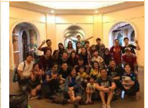
Handshake Tec SG 18/11/2016