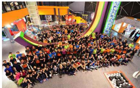
Indoor Mall Games