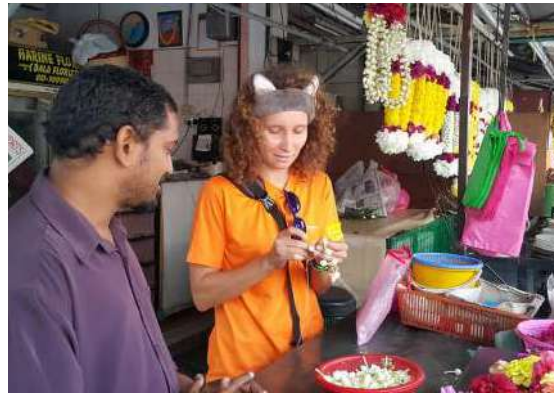
Penang Heritage Hunt