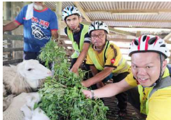
Balik Pulau Nature & Kampung Hunt